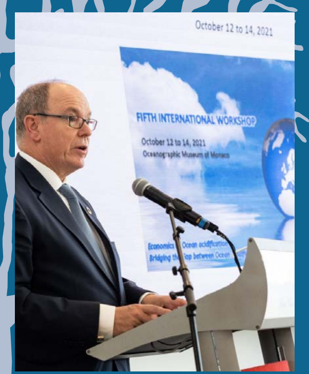
Photo HSH Albert II Prince of Monaco.

Blue carbon and other marine biological processes as a solution to mitigate the ecological and socio-economic impacts of climate changes in the ocean